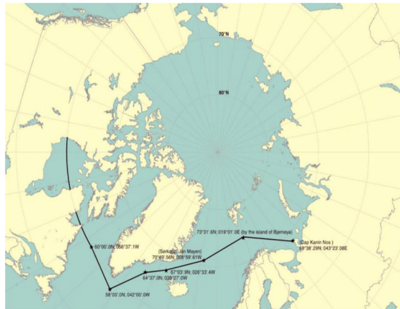
Figure 2. Geographical application of the Polar Code in the Arctic, as defined in SOLAS regulations XIV/1.3.